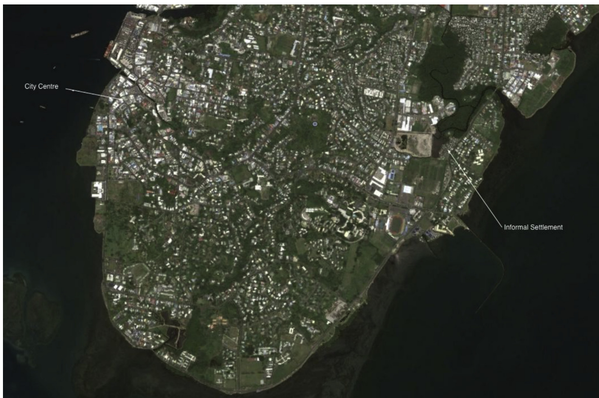
Fig. 1. Suva city, Fiji.

During the initial engagement with the community, the